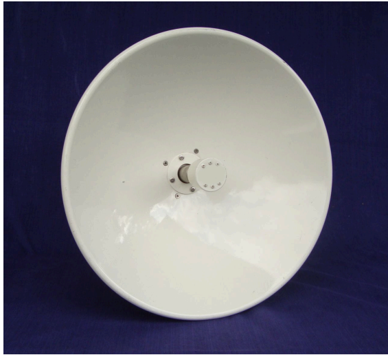
Parabolic Antenna with quickly release mount. 13GHz

Digital RF can provide a complete range of Antennas suitable for many Broadcast and Security applications.